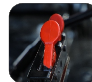
Auto Lift Button