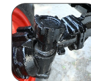
Carraro Front Axle in 4WD