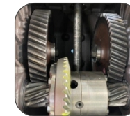
Helical Bull Gear