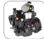
Powerfull Kirloskar Engine