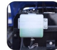
Radiator with Overflow Reservoir